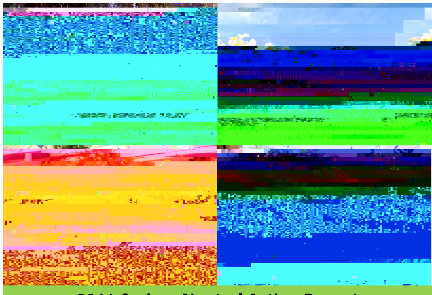
2016 Carbon Neutral Action Report Camosun College